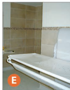
Changing benches: May be raised and lowered to a convenient height for washing, changing or physiotherapy; folds neatly away when not in use.