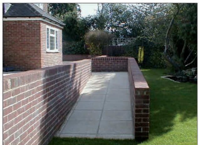
Ramps can be designed and built to meet a variety of needs.