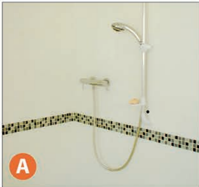
Thermostatic mixer: Responds to temperature changes in the incoming water supply to maintain a constant pre-set temperature.