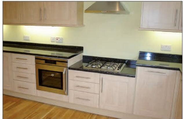
Kitchens can be designed to ensure easy access to hobs, ovens and controls.

Shown here are some examples of how space can be designed and created to provide barrier-free access and freedom of movement.