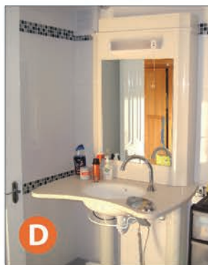
Adjustable height washbasin with flexible plumbing: Allows basin to be raised and lowered to suit individual needs; may be fitted with automatic taps.