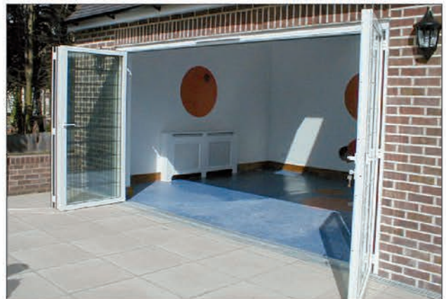
Open easy access environments allow wheelchairs to move around freely.