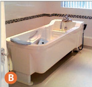
Rise and Fall bath: Allows the user to be at a convenient height for the assistant, making transfer easier and reducing the risk of back injury.