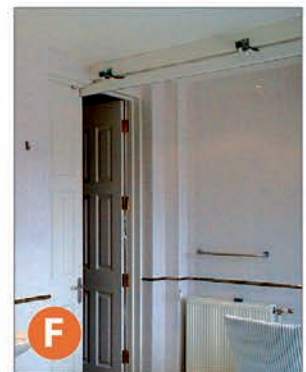
Tracking hoists: Used to help move people with more severe disabilities. The hoists can be designed to reach all parts of a room, and may be linked between rooms.