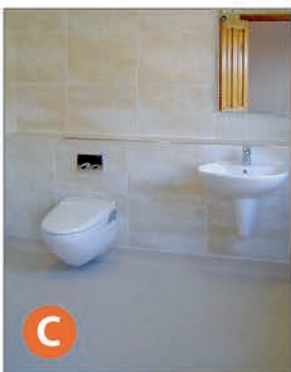
Shower toilet: Combines the functions of a toilet and bidet with warm air drying and odour extraction.